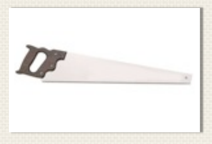
WHY WHY WHY?